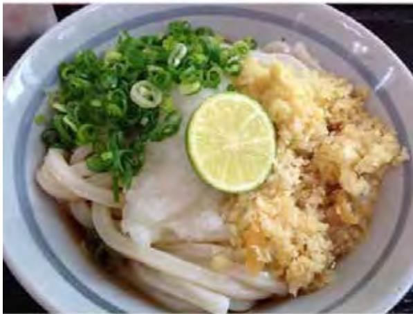
5杯目 冷ぶっかけ (おやつ) - 場所: さめきうどん職人 めりけんや