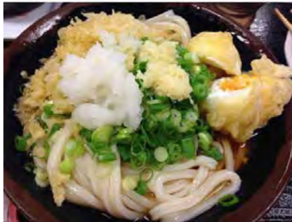
2杯目 冷やぶっかけ中 (2玉) に玉子天ぷら 旨し! - 場所: 手打十段うどんバカー代