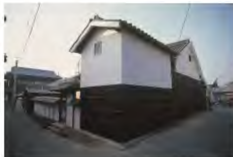
Art House Project "Kadoya"