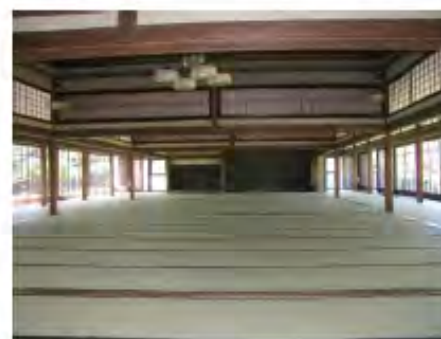
Daishyoin (230.04square meters)