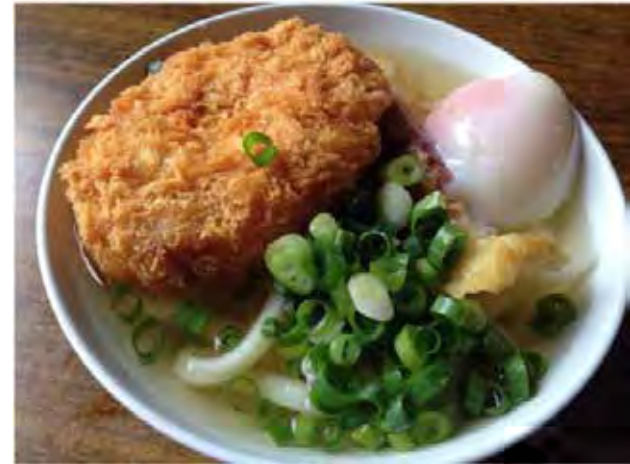
3杯目 朝ごはんなので温泉玉子にコロッケをつけて(´θ´)ノ - 場所: たむらうどん