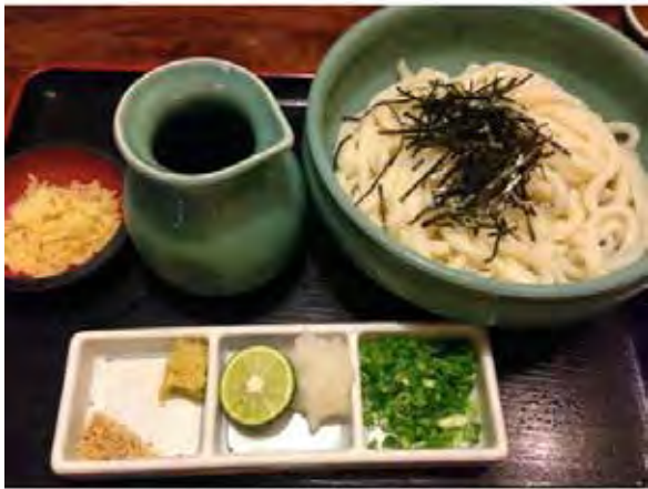
1杯目 ざるぶっかけ - 場所: うどん本陣山田家